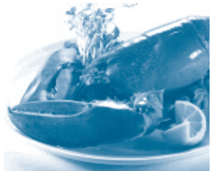
Shellfish such as lobster is forbidden under kosher law

Fish: To be considered kosher, fish must have fins and scales. Shellfish, octopus, and oysters are not kosher.