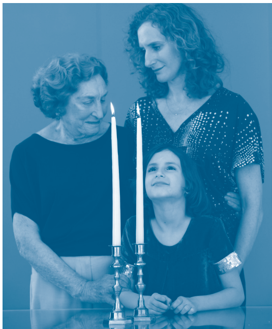
Family gathered around Shabbat candles

The only relaxation to these strict laws is when there is a potential threat to life. In this case, one is obligated to ignore every Sabbath requirement and immediately seek medical attention or call the police.