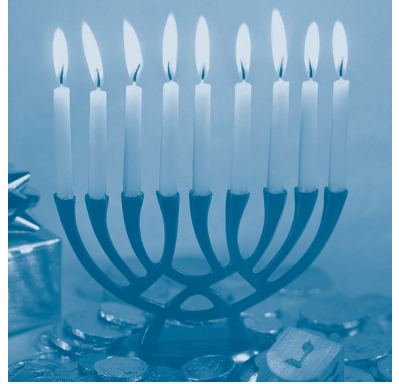
A traditional menorah

This joyous festival is celebrated in the winter around Christmas time by lighting a candelabra (called a menorah) every night for eight nights. Other traditions include eating food cooked in oil such as doughnuts and potato pancakes, giving presents, and holding parties.