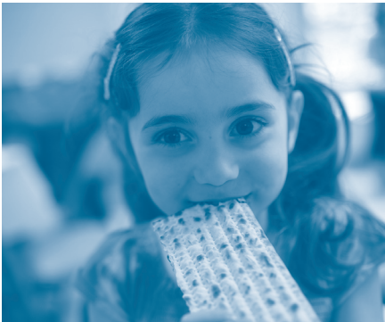
Matzah (unleavened bread) is eaten during Pesach