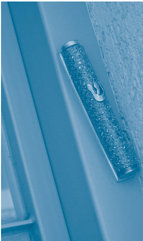
A mezuzah hanging on a doorpost

Observant Jewish men cover their heads at all times, usually with a small skullcap known as a yarmulke or kippah . Some may also wear a tasseled garment, called tzitzit , which is identified by knotted threads hanging below the shirt.