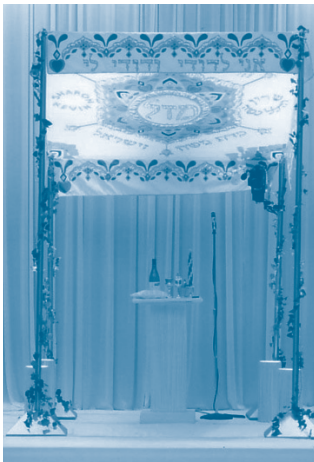
A Jewish wedding takes place under a chuppah, which represents the home

Every Jewish boy is required to be circumcised in a ceremony called brit milah . This takes place when the baby is eight days old, or as soon as possible thereafter if there are medical reasons for a delay. The circumcision is performed by a mohe , a trained Jewish practitioner who may also be a registered medical doctor. In the Orthodox community, the boy's name is frequently not announced until the circumcision. Girls are usually named in the synagogue, often on the Sabbath following the birth.