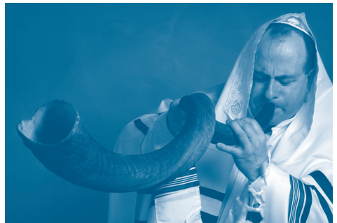
The shofar (ram's horn) is symbolically sounded during Rosh Hashanah