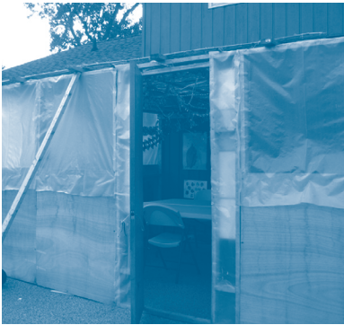
A sukkah, where all meals are eaten during Sukkot