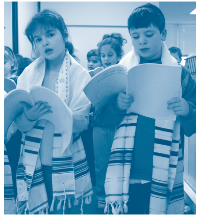
Children wearing prayer shawls during school prayers

Orthodox women can also pray, but they are not required to wear shawls or phylacteries during prayers. Synagogue etiquette varies depending on the denomination of Judaism.